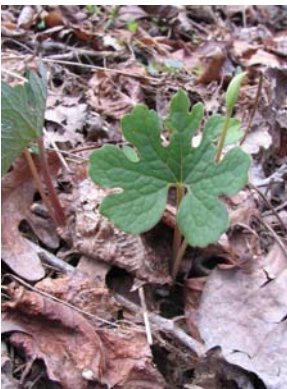
Bloodroot with seedpod

Bloodroot can be cultivated under an artificial shade structure or a natural forest canopy at 70%-80% shade. In the woods, bloodroot can be grown intensively in raised beds (referred to as "woods cultivated"), intensively in raised beds under an artificial shade structure (referred to as "shade grown"), or in a low-density, low-input method