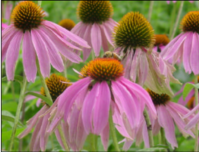
Echinacea (Echinacea spp.)