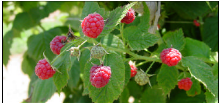
Raspberry (Rubus spp.)