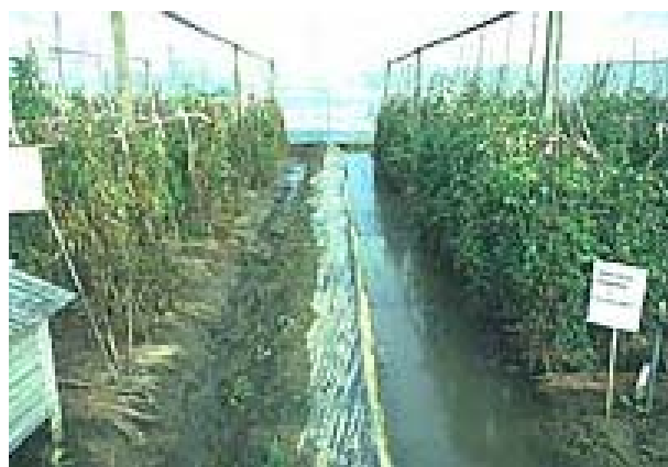
Fig. 1. Tomato plants stressed by flooding during the rainy season. Grafted plants (right row) are vigorously growing while non-grafted plants (left row) are dead.

Most eggplant lines will graft successfully with tomato lines. The key is to identify eggplant rootstocks that will maintain high yields and fruit quality of the scion variety. The lines should be resistant to bacterial wilt (caused by Ralstonia solanacearum ) and other soil-borne diseases. AVRDC recommends