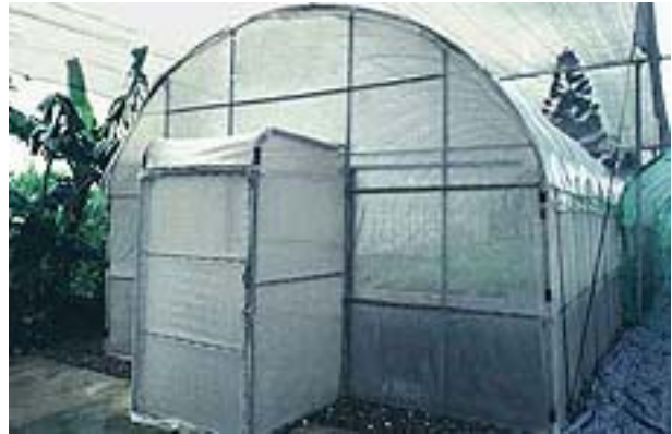
Fig. 2. Photo of screenhouse

The upper half of the structure should be covered with a separate layer of transparent, UV-resistant polyethylene to prevent rain penetration. A 50% shade net should be placed about 30 cm above the highest point of the house to reduce light intensity and temperature. Additional shading inside the screenhouse may be needed for plants during the first two or three days after being returned from the grafting chamber for hardening. A screened ventilation ridge along the top of the house is recommended for houses 6 m or more in width. This vent reduces the heat that accumulates in large screenhouses.